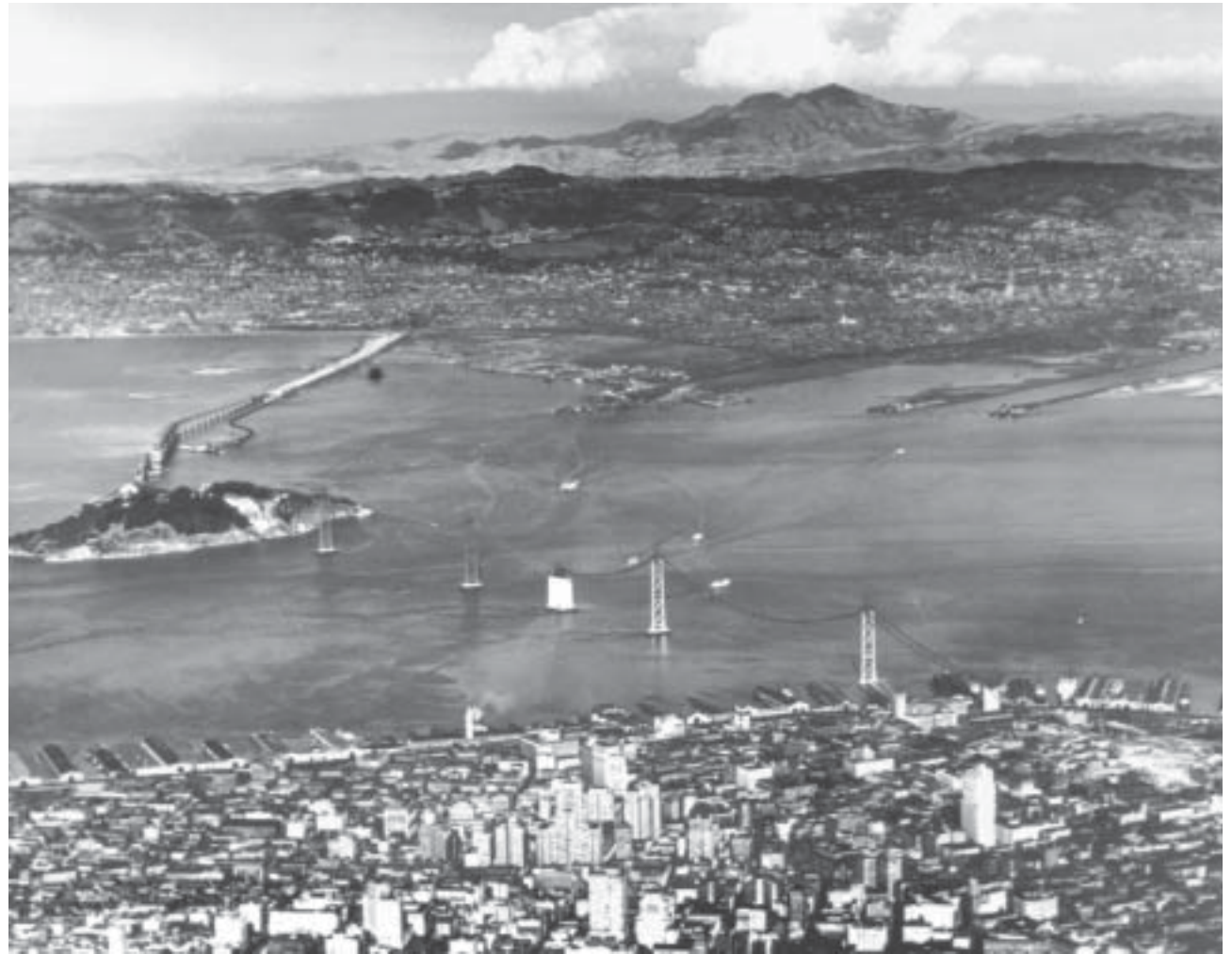
ABOVE: In 1935 the transbay ferries were still running, the Bay Bridge was nearing completion, and San Francisco itself was rapidly assuming its modern appearance. Then, as now, Mount Diablo rose above it all, serene and aloof, majestically dominating the eastern horizon. BELOW: View of Castle Rock from Shell Ridge.

In 1921, a parcel of land on the mountain was designated a state park, and much of the rest of the mountain was declared a game refuge. Standard Oil placed a ten-million-candlepower aerial navigation beacon on the summit in 1928.