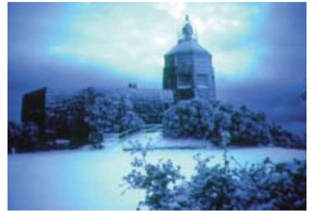
Unusual snowfall covers the Summit Building.

Summit Building and Museum — Constructed in the late 1930s by the California Conservation Corps, the sandstone for the building was quarried from Rock City. Remnants of ancient fossils can be found on the building.